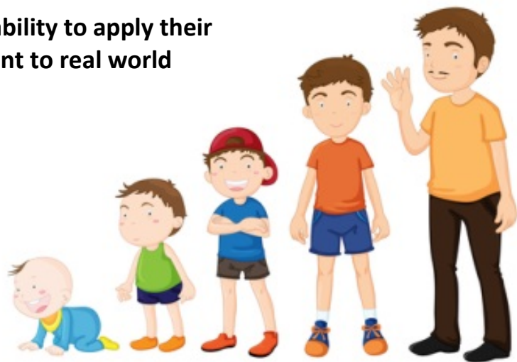
Infancy and Childhood