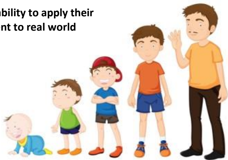
Infancy and Childhood