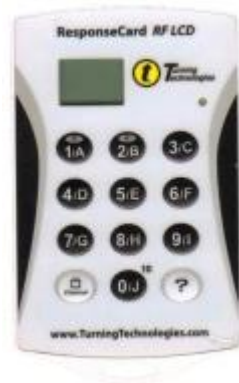
TurningPoint wireless Response Card (RF-LCD model recommended, older RF model acceptable )

Welcome to Psychology 101. This course will introduce you to the various topics and issues in the scientific exploration of mind and behavior. By the end of the semester, you should be well prepared to go on to study more advanced courses in our department. Along the way, you will discover what psychologists have learned that can enrich your studies, your relationships, your health, and other important aspects of your life.